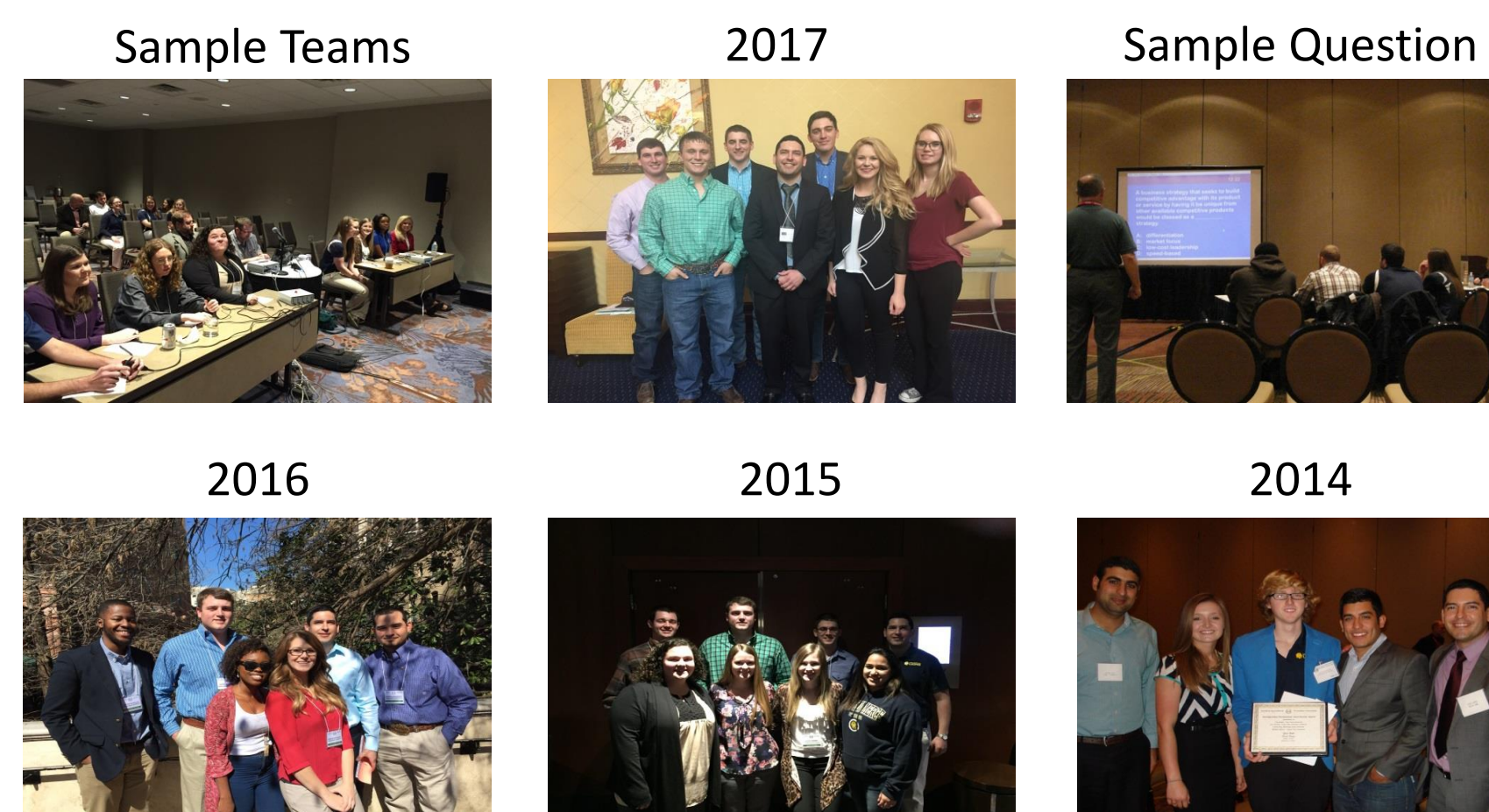
Figure 4. A&M-Commerce Students at SAEA Annual Meeting, 2014-2017.