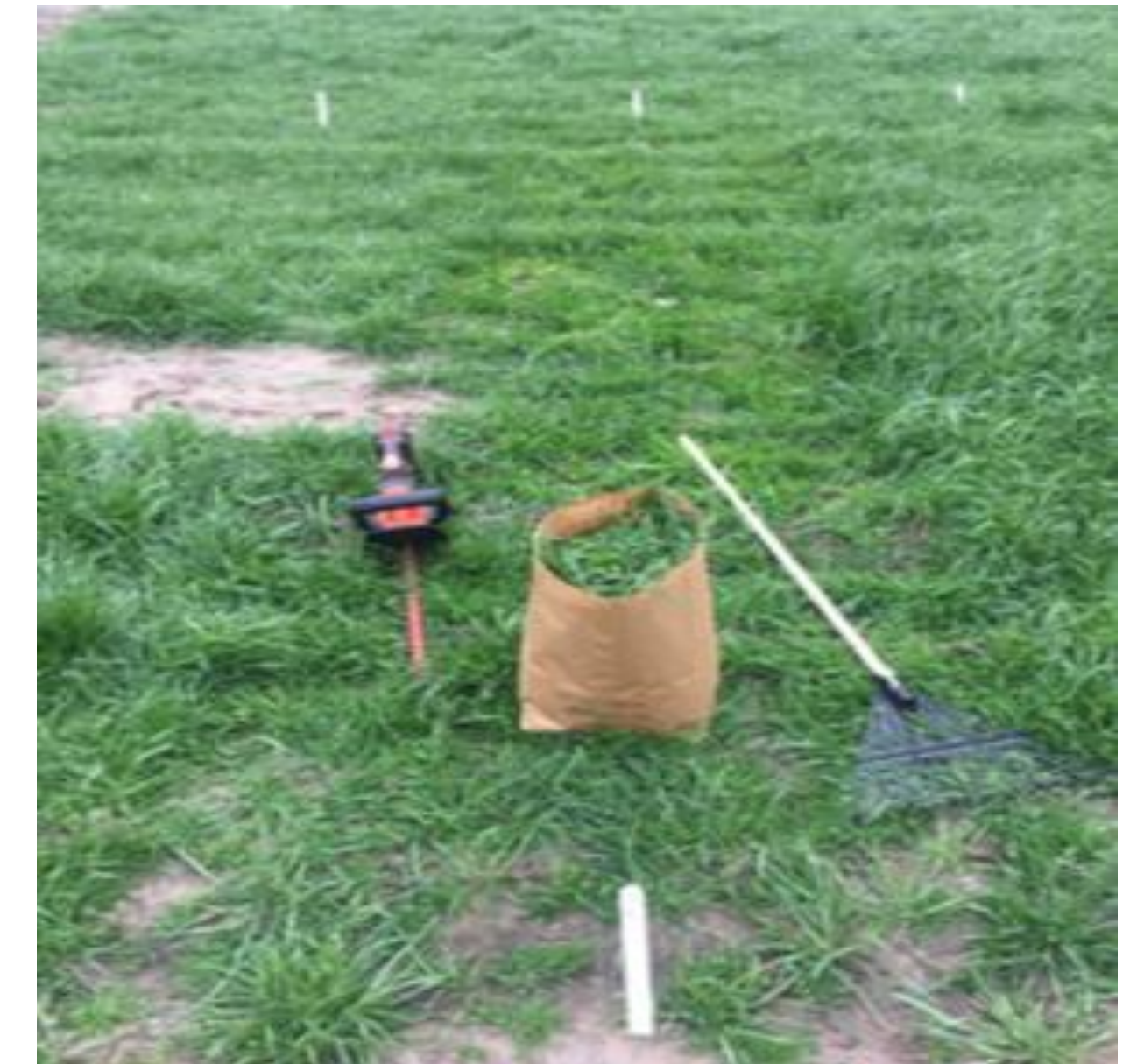
Figure 3. Forage harvest to estimate grazing production