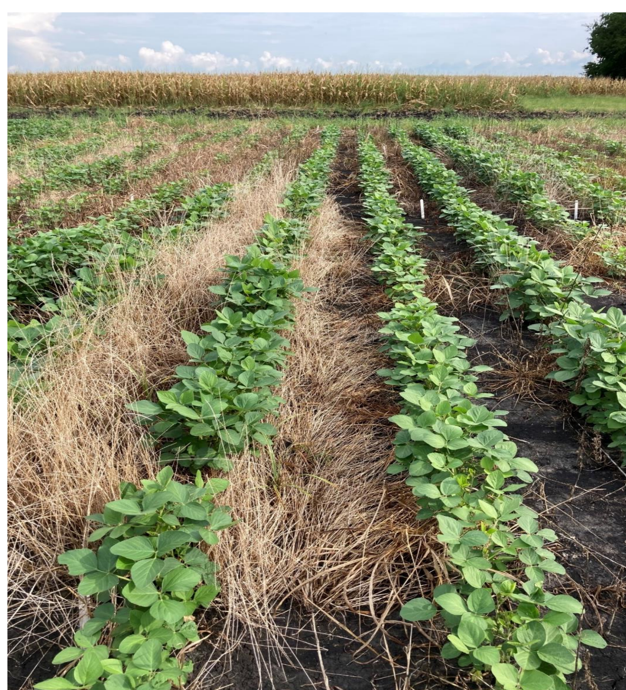
Figure 2. No-till Soybeans in an annual ryegrass cover crop plot

All forage and cover crop plots were terminated with Glyphosate or Paraquat at least 2 weeks prior to planting soybeans. Soybeans were seeded on April 21, 2020 and June 23, 2021 with a glyphosate and dicamba (Extend Flex) tolerant variety. All plots received a post emergent application of glyphosate, S-metolachlor, and dicamba to control weeds until harvest. Figure 2 shows a picture of soybean over the terminated ryegrass. Soybean seed yield was determined by hand harvesting a 1 m row in representative plots in 2020; in 2021 plots were harvested with a plot combine.